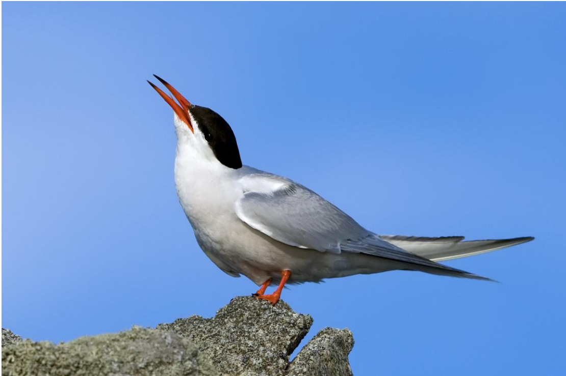
Photo 7. Common Tern ( Sterna hirundo ). Of all the local seabirds, terns are the most at risk from disturbance. Entire colonies are frequently abandoned, often due to man's activity during the breeding season.