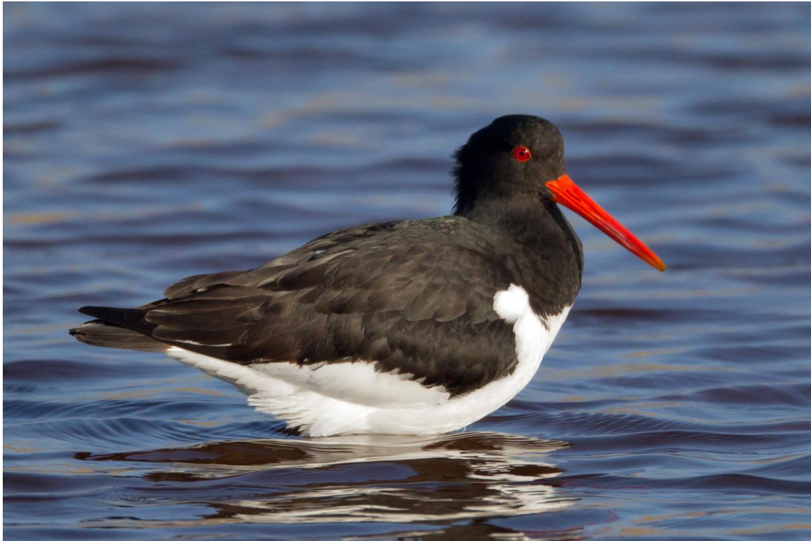
Photo 9.7.1. Oystercatcher ( Haematopus ostralegus ). Guernsey's only breeding wader species. Although resilient at the nest site, Oystercatchers often lose fail to produce fledged chicks due to disturbance and predation.