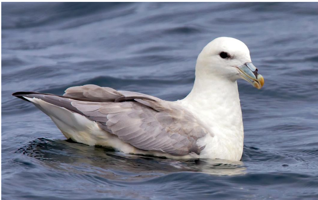
Photo 9.2.1. Fulmars ( Fulmarus glacialis ) colonised the Bailiwick in the 1980s and there is now a widespread stable population