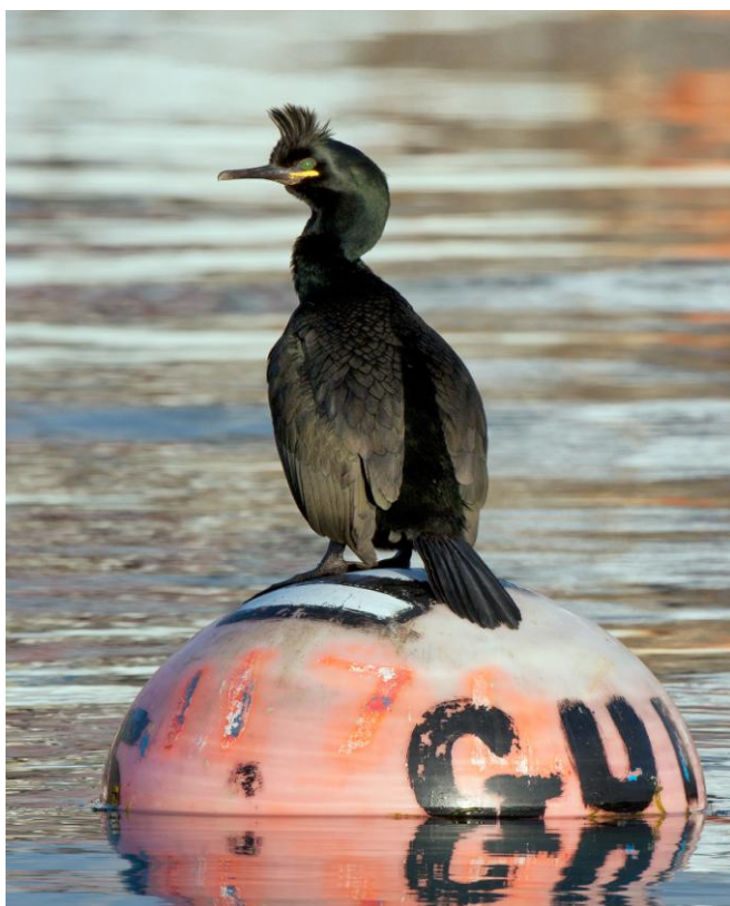
Photo 9.4.1. European Shag ( Phalacrocorax aristotelis ). Although this common species is often seen in near proximity to boats and marine infrastructure, the impacts of renewable energy are, as yet, unknown.

Any problems of turbidity are assumed to be localized and of much less importance than that experienced after severe storms. Such natural events can occur annually.