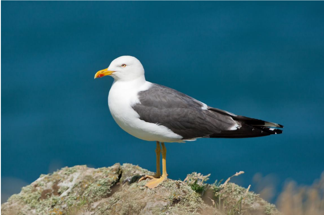
Photo 9.2.4. Lesser Black-backed Gull ( Larus fuscus ). This common species breeds throughout the area, often in small colonies. The Bailiwick supports internationally important populations.