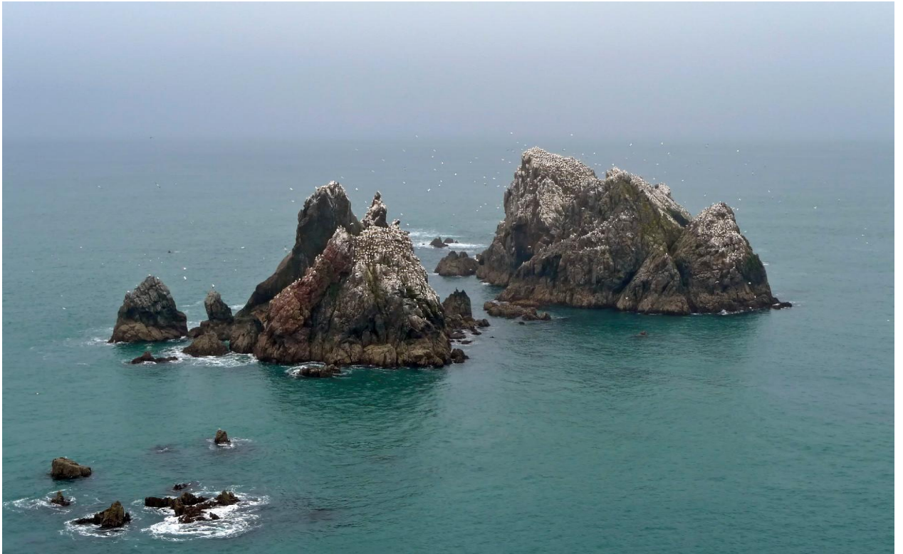
Photo 9.2.3. The Garden Rocks (Les Etacs) near Alderney. One of two local Gannetries