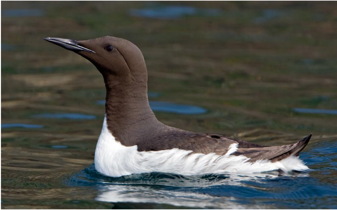
Photo 9.2.2. Guillemots ( Uria aalge ) dive to considerable depths in order to catch small fish