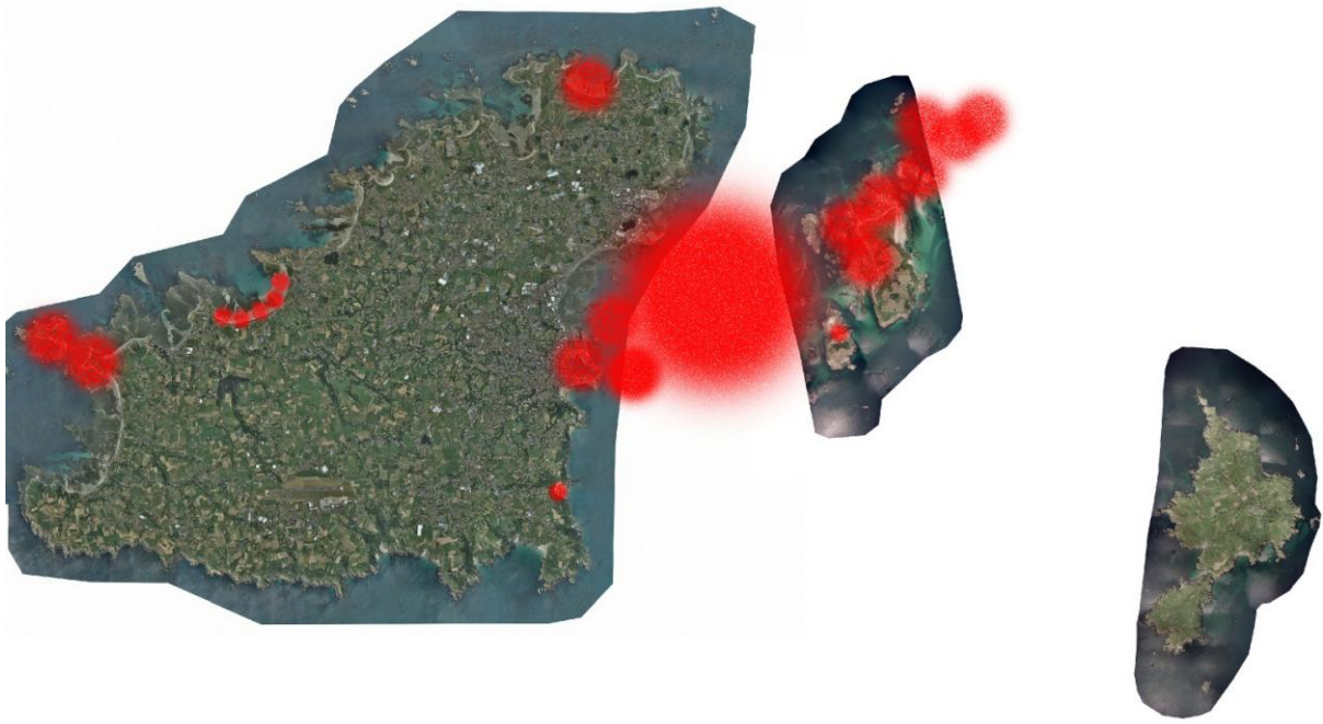
Fig. 13.6.1. Areas with highest concentration of coastal historic sites, and most likely locations for submerged sites.