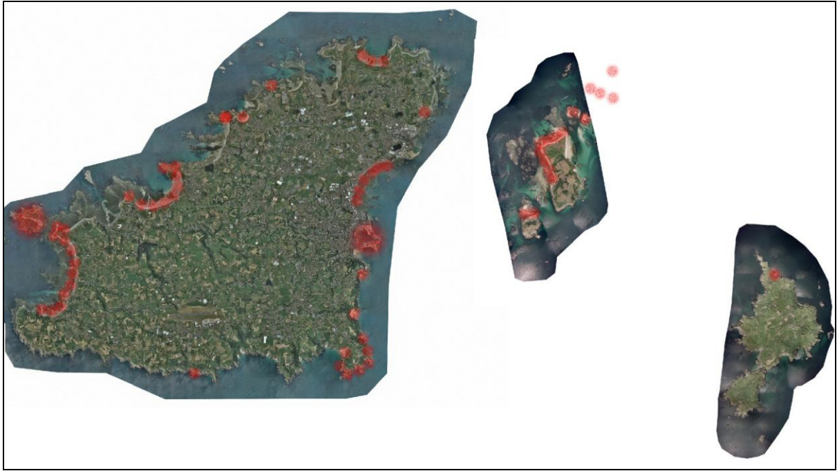
Fig. 13.4.1. Coastal zones of particular archaeological and historic sensitivity.