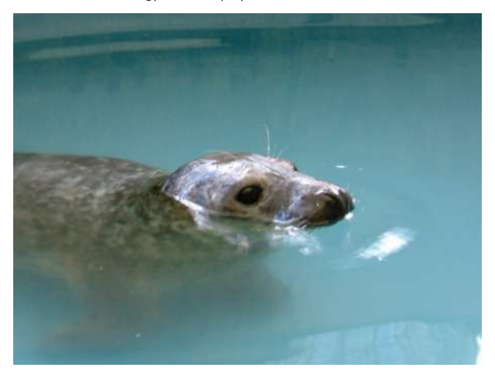
Figure 10.2.1 Atlantic Grey Seal pup (M J Gavet)

come ashore during the breeding season to give birth, and at other times to moult their fur. The distribution of seals around the coast and the timing of lifecycle (pupping and moulting) will be potentially important considerations for the timing of marine renewable energy device deployment.