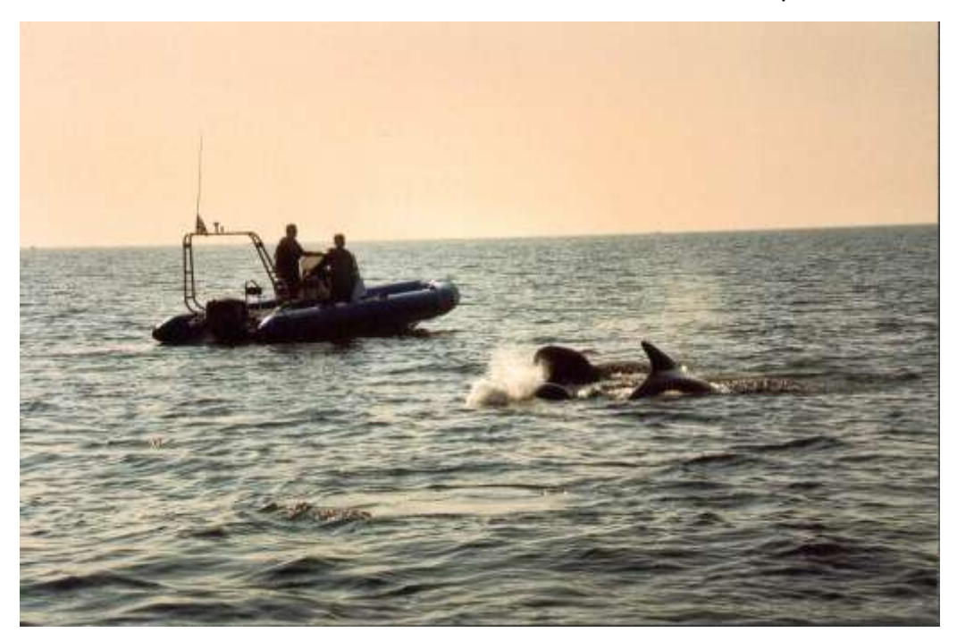
Figure 10.2.2 Long-finned Pilot Whales off Fermain, Guernsey

The waters around the Bailiwick of Guernsey (the REA study area), are used by a diverse range of cetaceans. The area offers a variety of habitats in close proximity as well as areas of high productivity. Despite the abundance and diversity of cetaceans in local waters our knowledge of the abundance and particularly the population structures and conservation status of these animals remains remarkably basic.