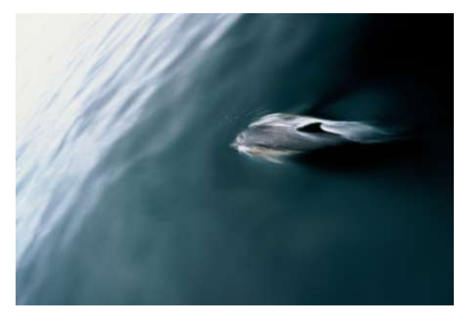
Figure 10.2.4 Common Dolphin by Mike Cave

Cetacean eyes are placed on both sides of the head and so give a more panoramic view. The visual fields do overlap, but binocular vision has yet to be demonstrated.